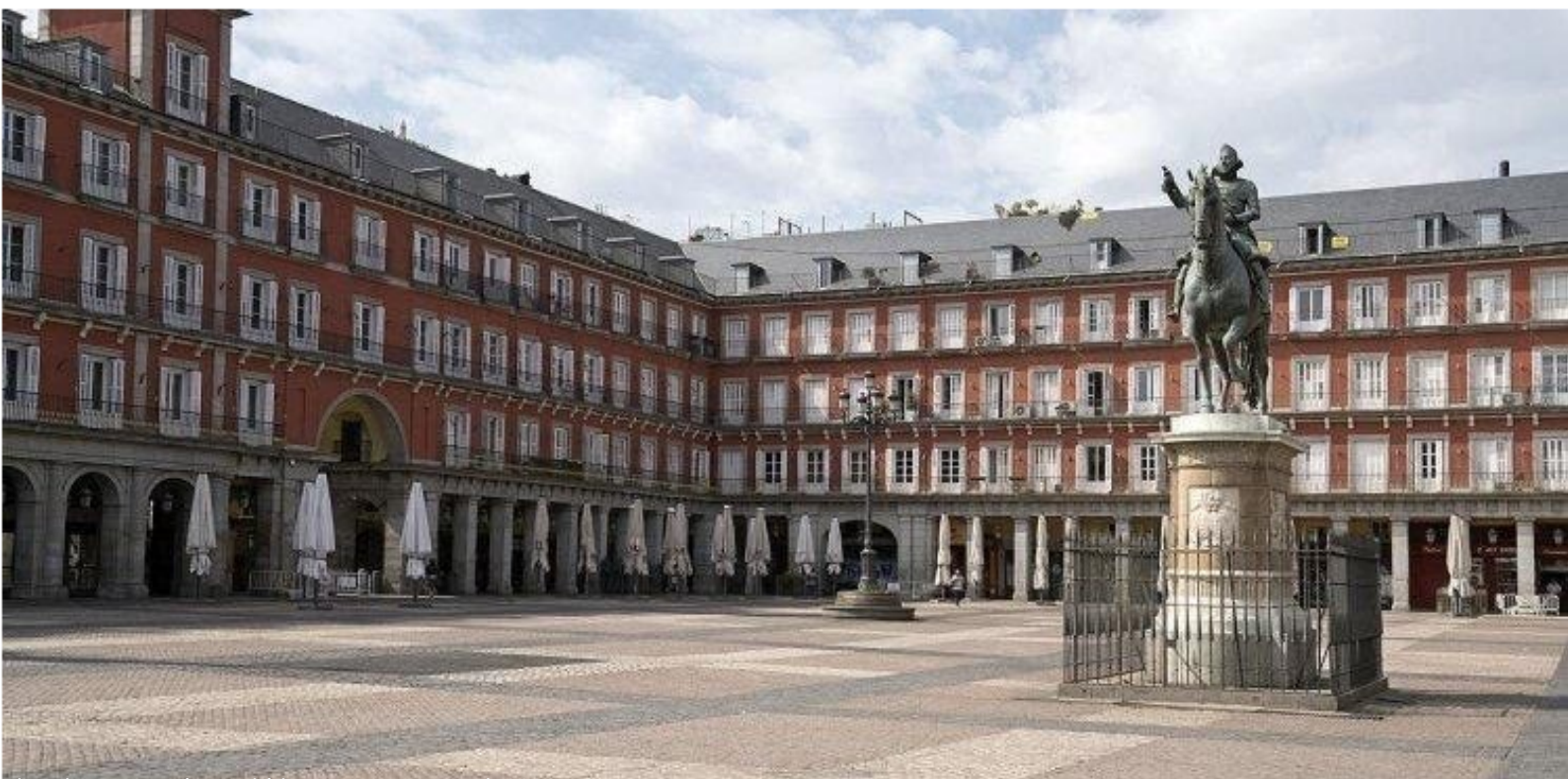
The Plaza Mayor in Madrid, empty on 15 March 2020