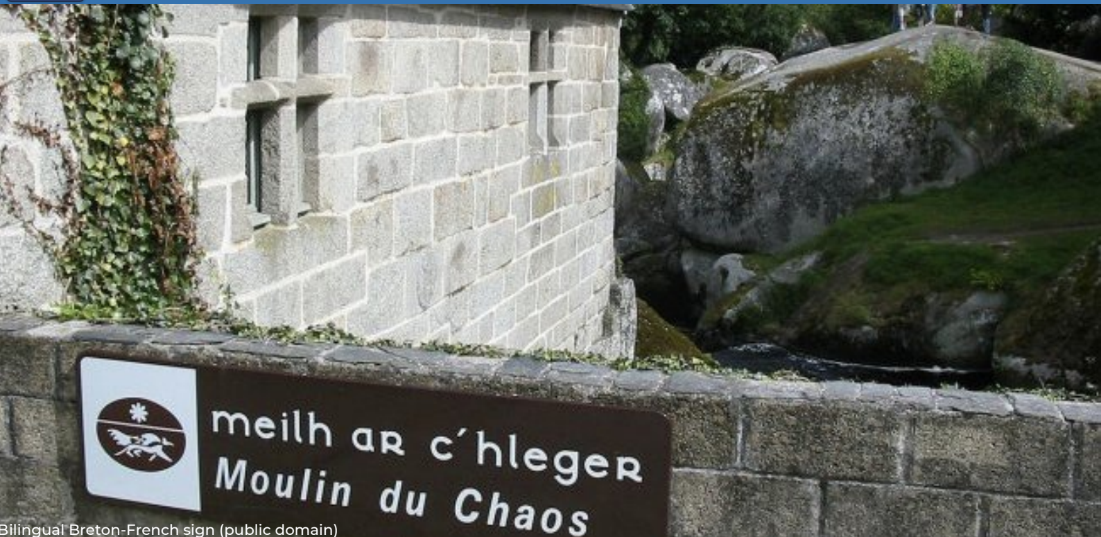
Bilingual Breton-French sign (public domain)