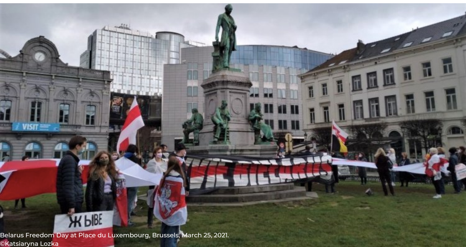
Belarus Freedom Day at Place du Luxembourg, Brussels, March 25, 2021.