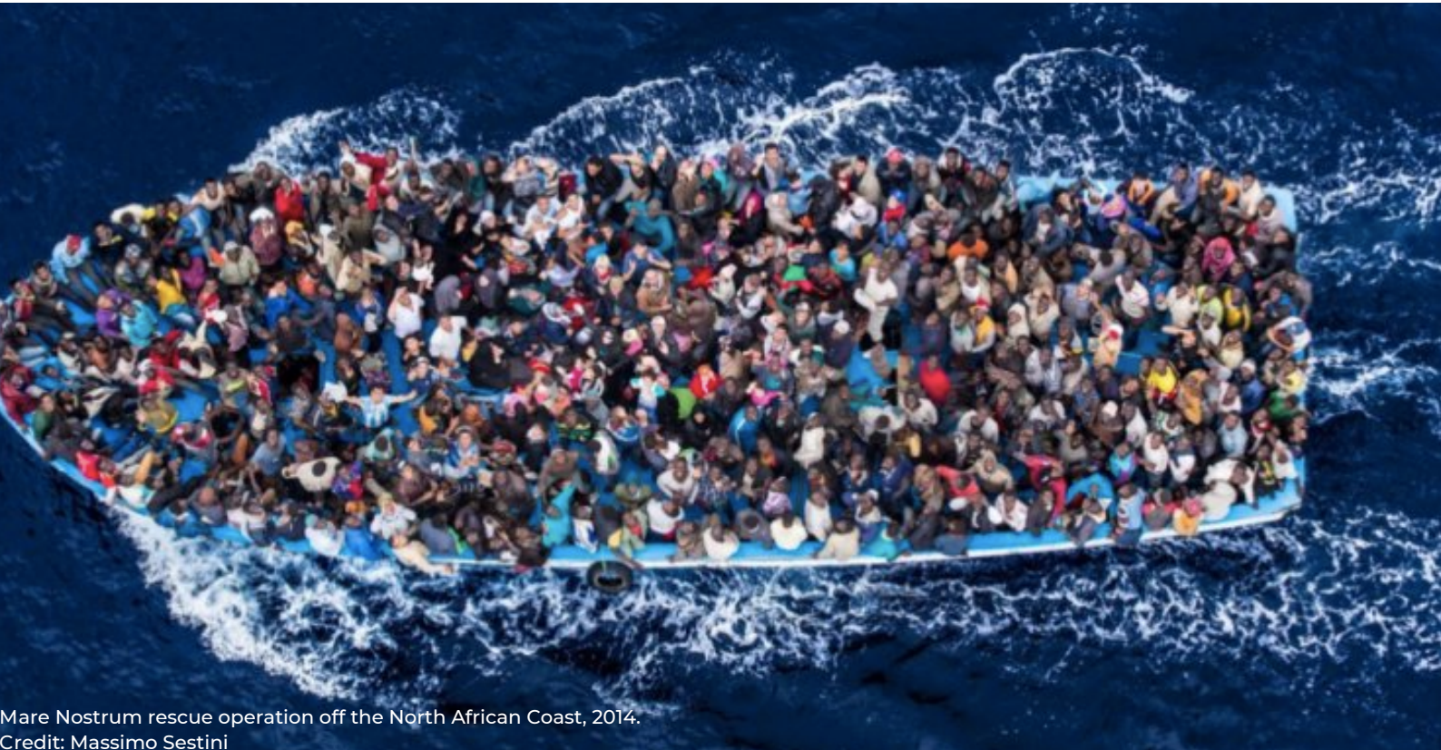
Mare Nostrum rescue operation off the North African Coast, 2014.

See all our stories at thenewfederalist.eu .