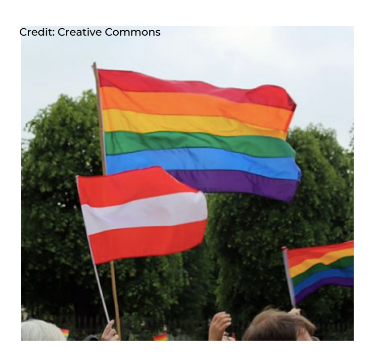
Read the full article on our website